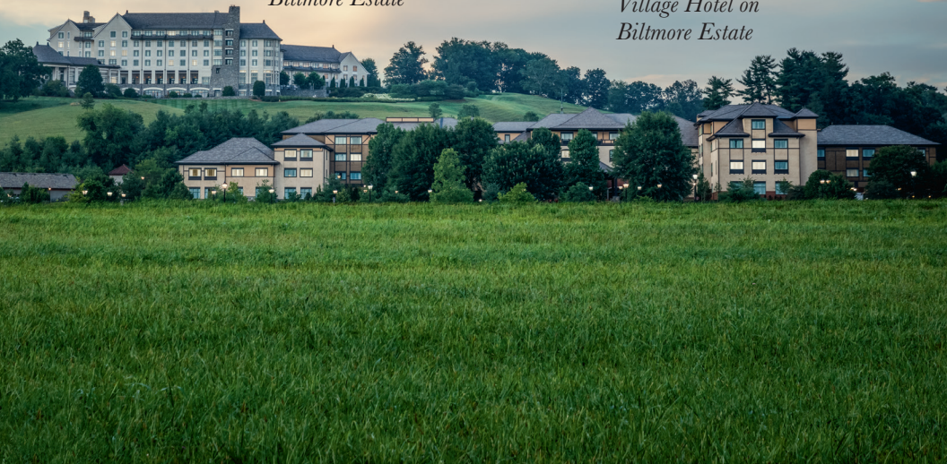
Village Hotel on Biltmore Estate